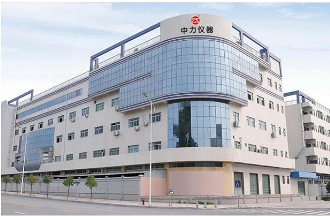
Company outdoor view